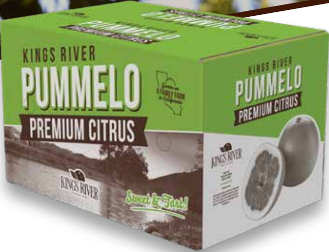
40 LB CARTONS